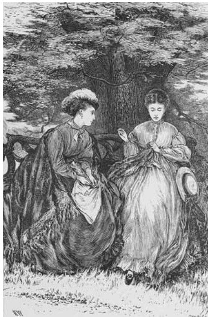
'She loves him herself, Angela was thinking.'

He and Angela meet at Mrs Bormalack's lodging house, and fall in love. He tells her his dream of a Ruskinian People's Palace of Delight for the East Enders and Angela (now the richest woman in England) secretly sinks her wealth into the project. They marry, and he discovers the pleasant truth. Besant subtitled the novel 'An Impossible Story' because a friend told him that his 'Palace' would never materialise. It did, partly due to the author's efforts, in 1887, although it did not as in the novel transform Stepney into an earthly paradise.