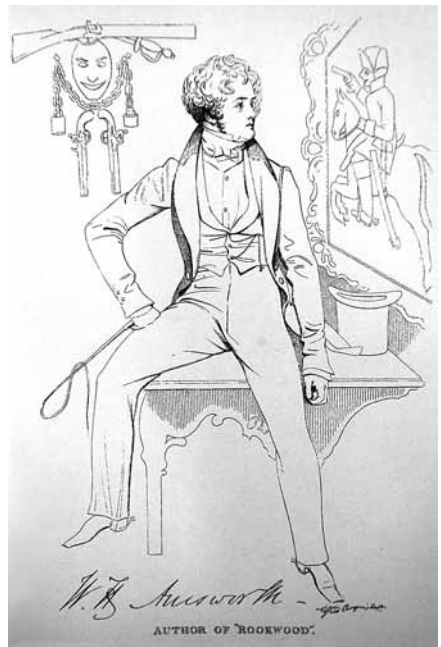
Harrison Ainsworth, by Daniel Maclise, from his collection The Fraserians .

Ainsworth's Magazine (1842–54). Ainsworth founded his magazine in opposition to Bentley's Miscellany *, which he had previously edited. Subtitled 'A Miscellany Of Romance, General Literature And Art', the journal appeared