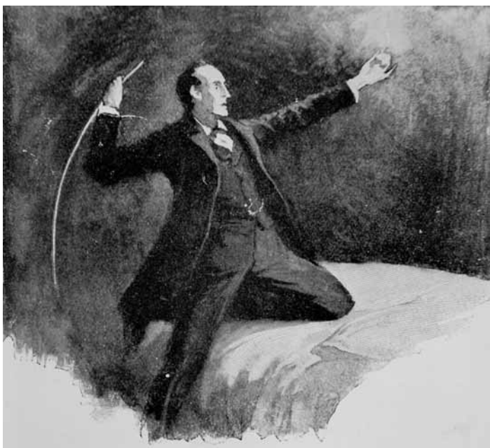
'Holmes lashed furiously with his cane.' Sidney Paget's illustration to 'The Speckled Band', The Adventures Of Sherlock Holmes , Arthur Conan Doyle, 1892.

a literary cult object. Some 20,000 copies of the Adventures were sold within the year. Doyle was constrained to write a sequel, The Memoirs Of Sherlock Holmes (1894), which ends with the hero apparently plunging to his death in the Reichenbach Falls grappling with his great adversary Professor Moriarty on 4 May 1891. American publishers induced Doyle to revive the detective for yet another series, The Return Of Sherlock Holmes , in 1905.