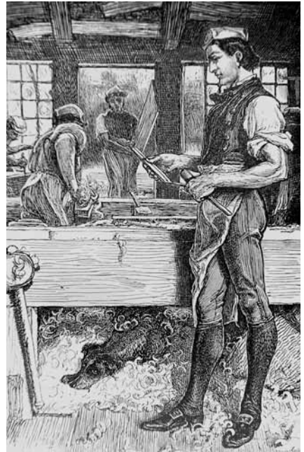
'In his tall stalwartness Adam Bede was a Saxon, and justified his name.' From a cheap (6 s.) reprint of Adam Bede , George Eliot, 1874: illustrator W. Small.

Adam Bede , George Eliot, 1859, 3 vols, Blackwood. Eliot's first full-length novel. A runaway success, it provoked intense curiosity about the mysteriously pseudonymous author. Adam Bede is set in 1799–1807, in rural 'Hayslope' which is recognisably a village in Eliot's native Warwickshire. The Methodist revival is historically central in the narrative which opens with a scene introducing the carpenters Adam and Seth Bede. Adam, the harder and more interesting of the brothers, loves Hetty Sorrel who lives with her aunt and uncle Poyser at Hall Farm. Hetty is beautiful but shallow. Her cousin, Dinah Morris (also an orphan), is a Methodist evangelist, and has the moral depth Hetty lacks. Seth loves Dinah, but his adoration is returned only as friendship. The naively well-intentioned squire, Arthur Donnithorne, who has just come of age, sees Hetty in the dairy, and is captivated. Neglecting the counsels of his mentor, the Rev. Adolphus Irwine, Arthur seduces Hetty. Adam discovers what he thinks is mere flirtation, and thrashes the young squire